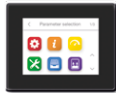
3.5" touch display

All HygroMatik FlexLine units are equipped with a capacitive 3.5" touch display. Operation and programming are selected via a flat and intuitive menu structure analogous to modern smartphone logic. In addition to this, subsequent software updates are quickly and easily possible via USB flash drive.