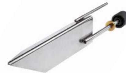
Replaceable stainless steel large area electrodes for different conductivities