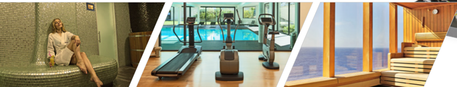
Spa resorts and wellness hotels

The basic FlexLine model is the basis for all other configuration options. Thanks to individual extension capability the FlexLine can be adapted to the differing applications in the spa and wellness sector.