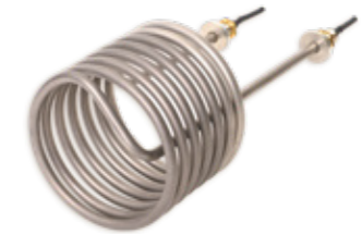
Resistor type heater elements in highly corrosion-resistant alloy